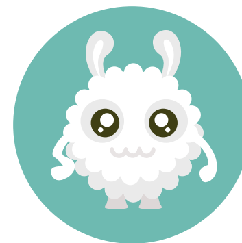
White [ waɪt ]