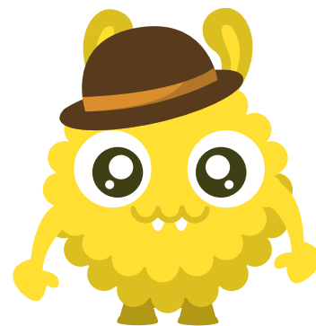
Yellow [ 'jeləʊ ]