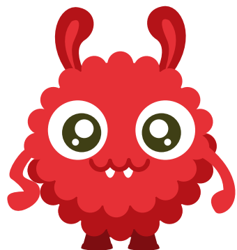
Red [ red ]