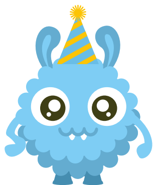
Blue [ bluː ]