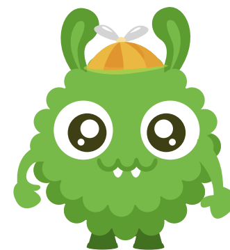
Green [ grɪn ]