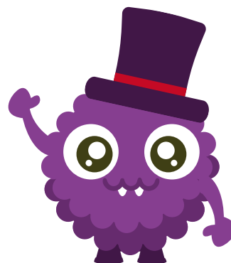
Violet [ 'vaɪələt ]