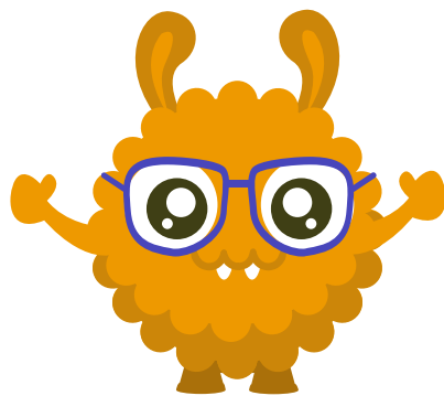
Orange [ 'ɒrɪndʒ ]